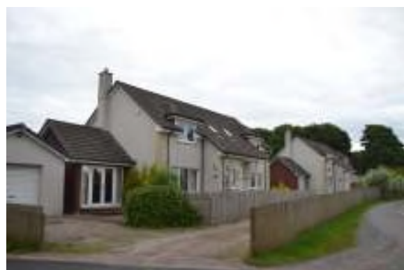
4 New houses to North of the site