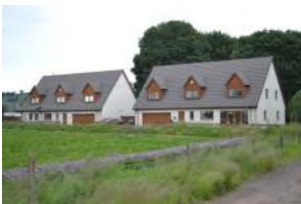
3 New houses to the North East of the site