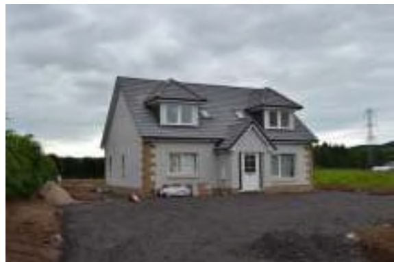
2 New House to West of Littleton Road