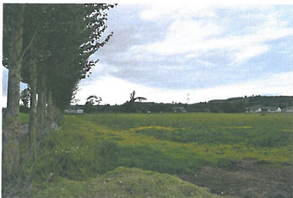
12 View looking northwest across the site

9.9 This consideration leads to the conclusion that the proposed development can be fully and reasonably justified against the provisions of 'Policy RD3' insofar as the proposed development represents an extension to the "building group" (albeit a significant one). The location of the industrial use on the southern boundary reinforces the extension to the building group by filling in this gap between the residential and industrial uses.