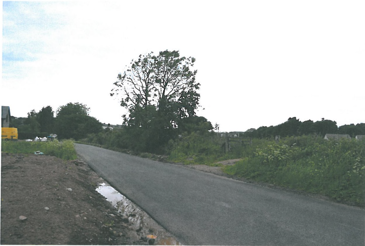
9 Approximate location of site vehicular access point

7.2 The indicative layout confirms that there is sufficient parking within the curtilage of the dwellings. This car parking is not in front of the dwellings but up the site to minimise visual intrusion but also to ensure that garages can be accommodated if required.