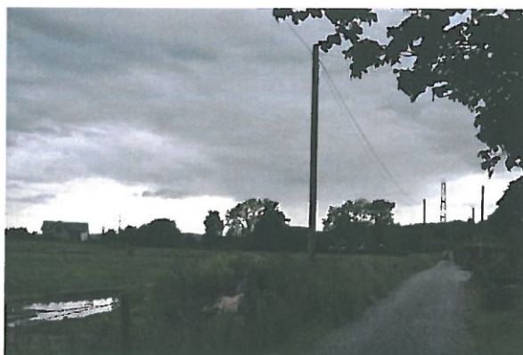
4 Public roadway to North boundary