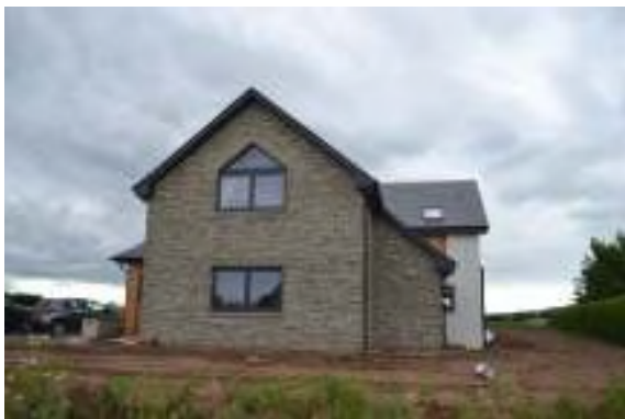
1 New house to West of Littleton Road

dwelling. We would contend that by reflecting the various new developments on the Western side of the road the application reinforces this building group. The various developments to the West are not filling gap sites yet have recently been Approved by Planning. This is forming a linear development on one side of the road but nothing on the other. It makes sense in Planning terms to develop both sides of the road in order that a village type townscape can be achieved. In spite of the Reason for Refusal quoting Policy RD3 of Perth and Kinross Council adopted Local Development Plan 2014 stating that any development should 'not contribute towards ribbon development' the two new houses constructed to the West side of the road does exactly that . Where there was once before individual houses along this side of the road there is now a strip of ribbon development. The new houses did not fill a gap site as the frontage greatly exceeds that recognised as being a 'gap' between existing units. This application is not extending the ribbon development it is effectively widening it and there is no provision within the LBP stating that this cannot be permitted. It is providing an opportunity for an identity to be formed by creating houses on both sides of the road; as happens in villages across Perthshire, rather than the existing incongruous strip of houses currently experienced.