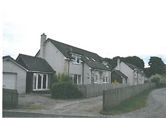
11 New houses to North West of the site

8.3 Individual plot boundaries will be delineated by beech hedging (ie no ranch style fencing).