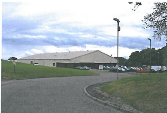
1 Industrial building to South

3.1 The application site, herein referred to as the "site", lies to the north of an industrial manufacturing plant with substantial car parking areas ('Tokheim Solutions Ltd'; which produces petrol fuel pumps, etc). This building is approximately 8 metres in height. To the East is agricultural land (including polytunnel farming); to the West is residential; along the North boundary is residential properties stretching in a ribbon development to the East.