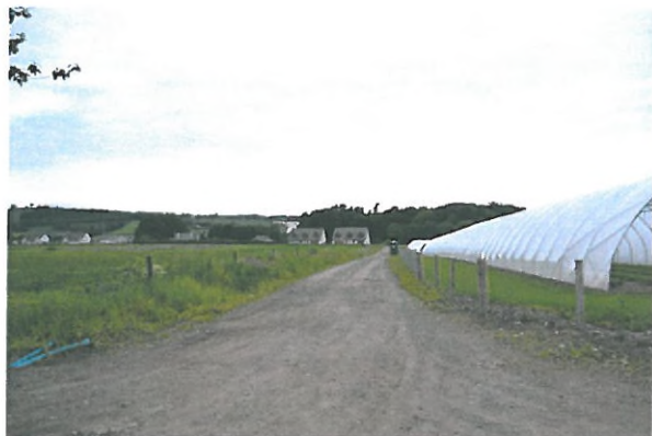
3 Roadway / fencing to East boundary

3.3 Old Littleton Road is present to the East of the site from which the site will be accessed. Existing private access roads are present further to the North, along the south and an established farm track and fencing further to the east. At the South West corner of the site are two telecommunications masts which are surrounded by steel security fencing.