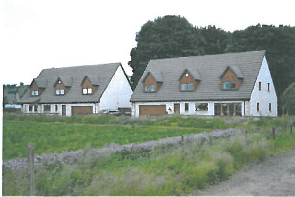
10 New houses to the North of the site