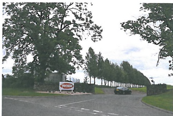
2 Vehicular entrance to industrial building

3.2 The site area extends to 5,945sq.m.(0.59 hectares) and the topography falls very gently from north to south.