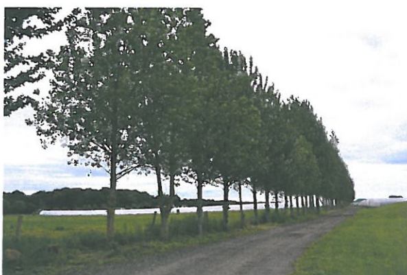
5 South boundary road and landscaping