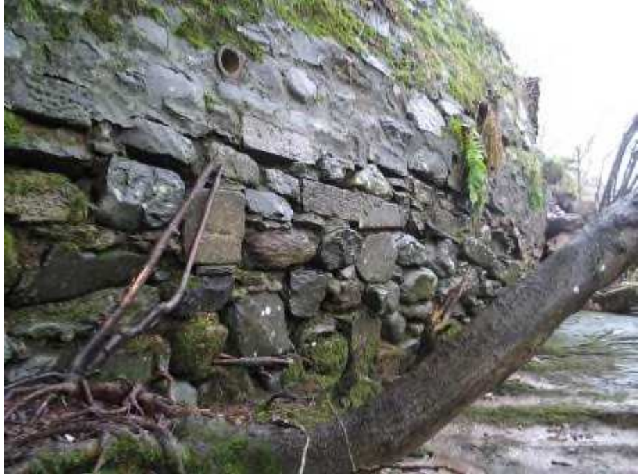
Bedrock and Sections of Retaining Wall on Leased Land