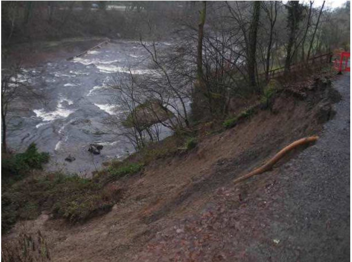
2012 Landslip Damage