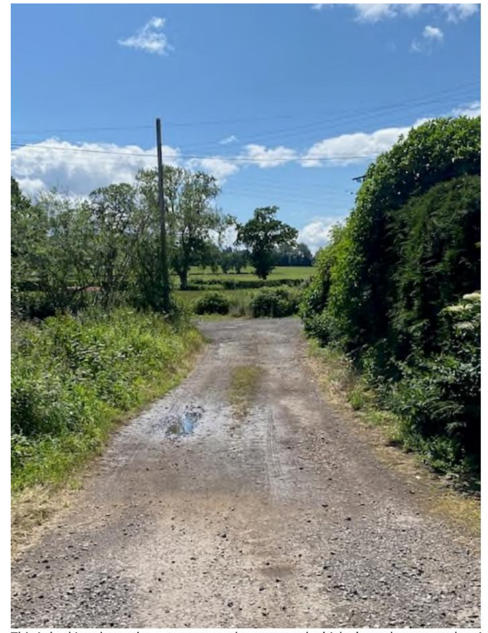
This is looking down the new proposed access road which shows how poor the visabilty is for other traffic coming from 3 sides. There is also kids that use these roads for active play and cycling and will cause a serious concern regards accidents and injuries.