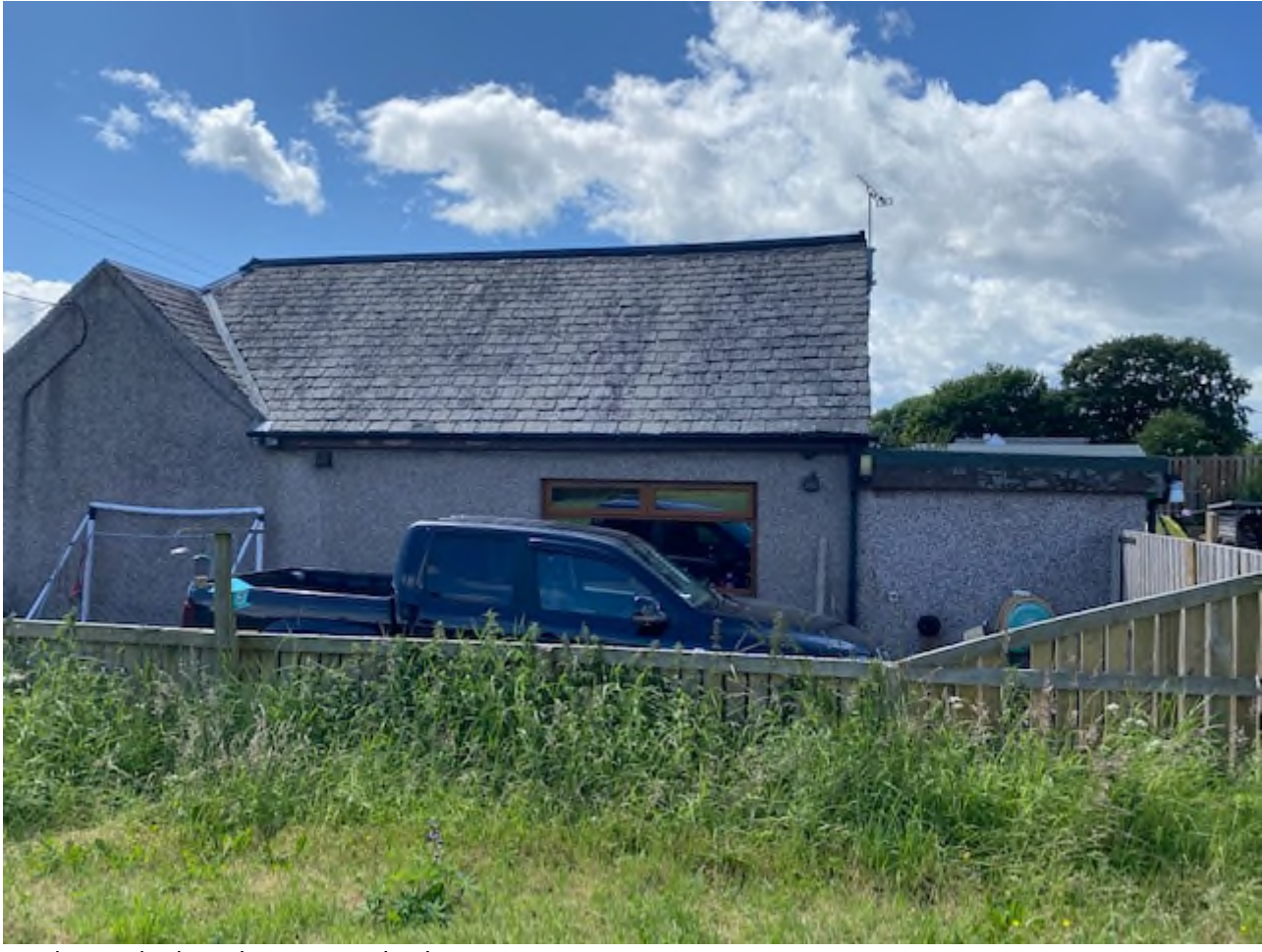
On the site looking down on my kitchen.