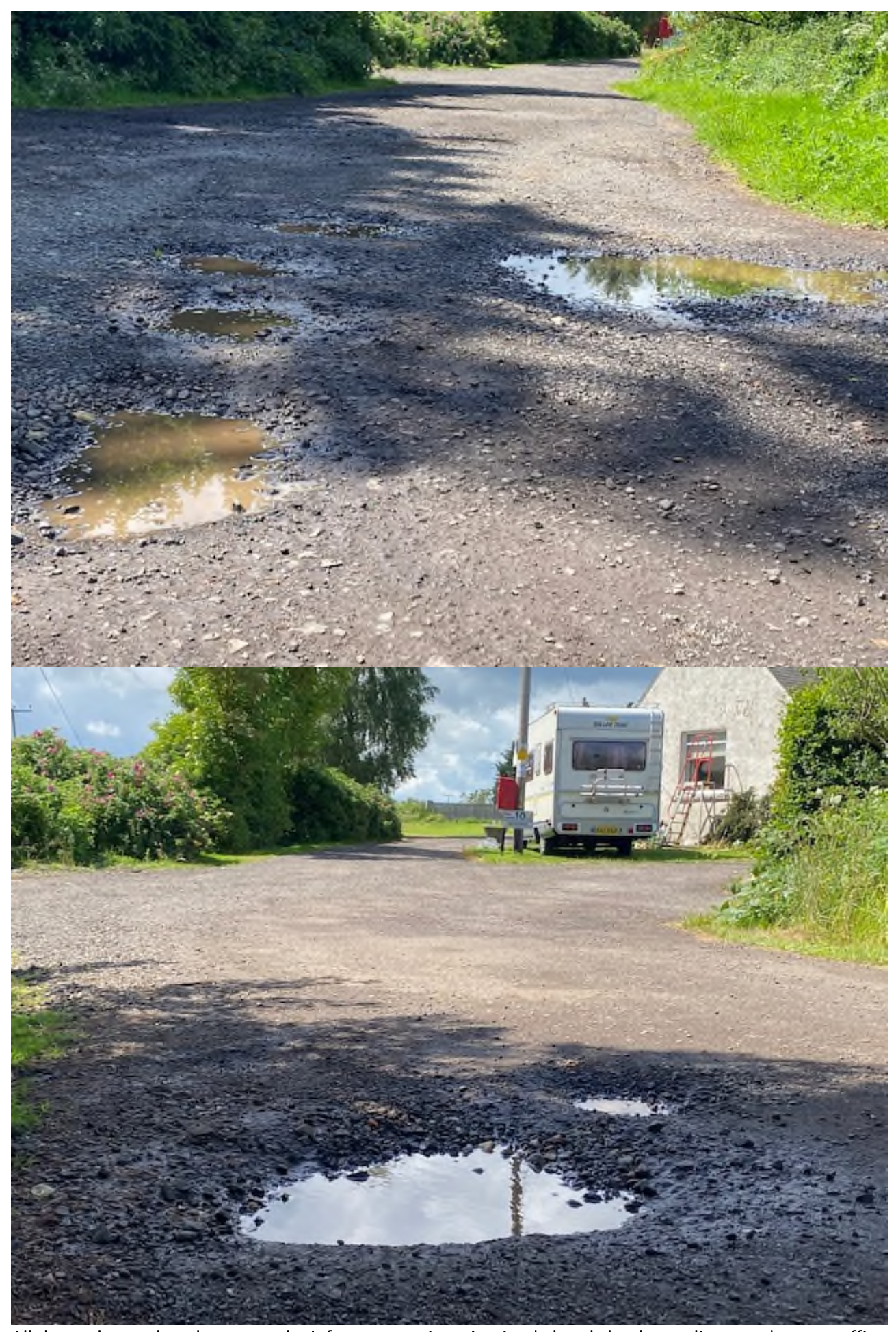
All these photos show how poor the infrastructure is maintained already by the applicant and more traffic and construction traffic will make this massively worse.