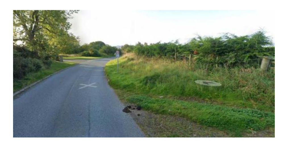
East boundary of the site defined by existing bank and hedging.