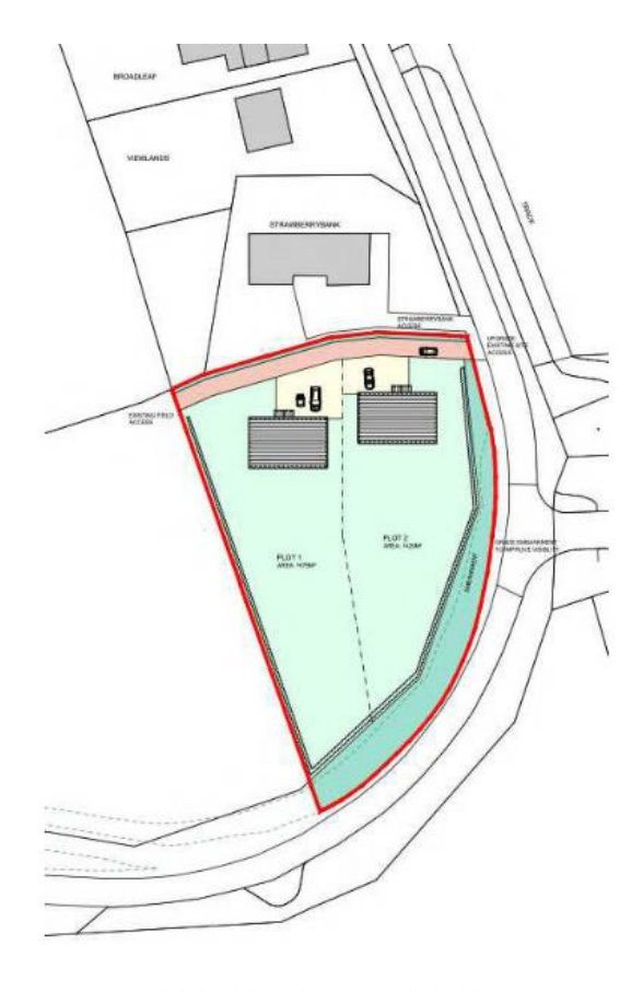
Proposed indicative layout.

The proposed houses will be set within an enhanced landscape setting with new native landscaping to the west and south which will provide improved biodiversity opportunities within this area. The site benefits from an existing access to the public road which will provide safe access to the proposed house. In terms of servicing, the proposed house will have SUDs and septic tank.