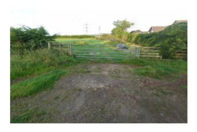
Existing access to Old Littleton Road