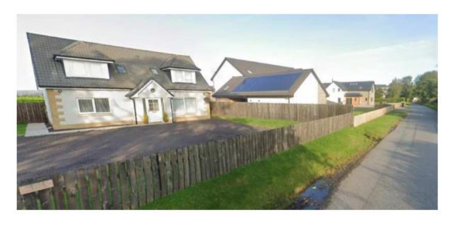
Recent infill development on Old Littleton Road