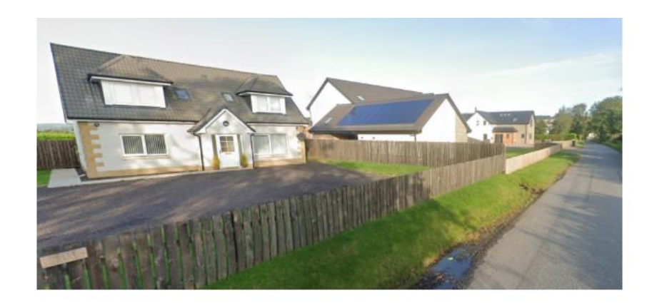
Recent infill development on Old Littleton Road