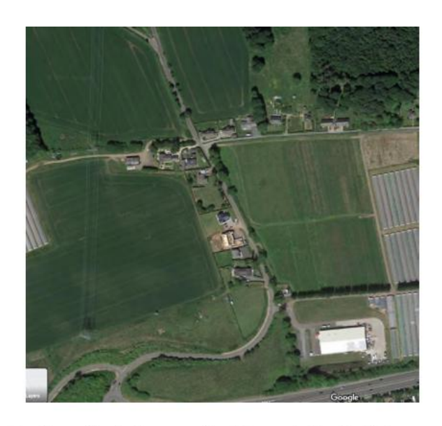
Application site to the south of the existing building group