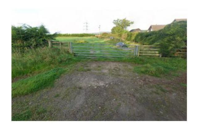
Existing access to Old Littleton Road