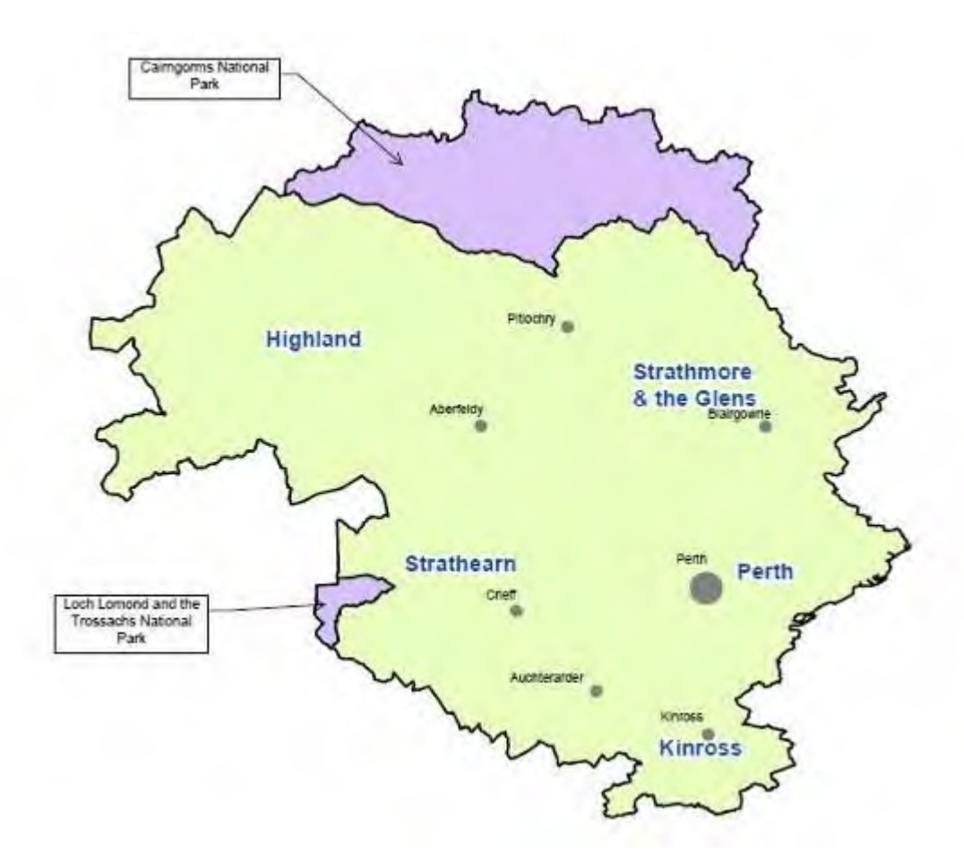
Map 1 – Local Development Plan Area for Perth and Kinross Council