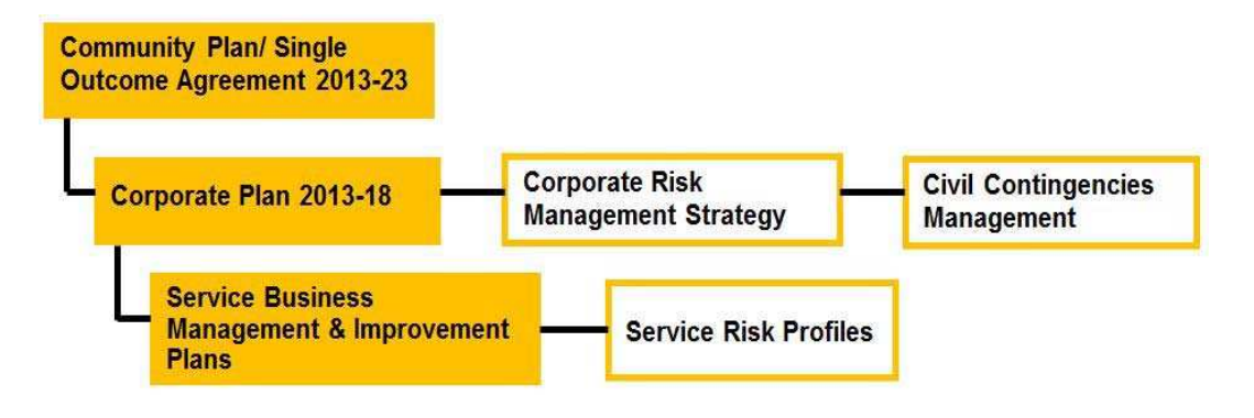
Diagram 1: Perth and Kinross Council's Golden thread