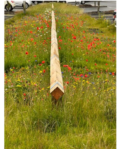
Wildflower Raingarden at the Kinross Park & Ride

A special note should be made of the involvement of teachers, pupils and parent groups in hands on delivery of projects at schools, the Kinross Park and Ride - part of the Kinross Raingardens trail - winner of a Ciria Susdrain SUDS Awards 2022; the delivery of Tayside Biodiversity Partnership's innovative Biodiversity Towns and Villages Blairgowrie & Rattray and Guildtown; and the wide involvement of schools, In Bloom groups, local wildlife groups and volunteers who helped deliver many of the projects led by the Tayside Biodiversity Partnership and Community Greenspace.