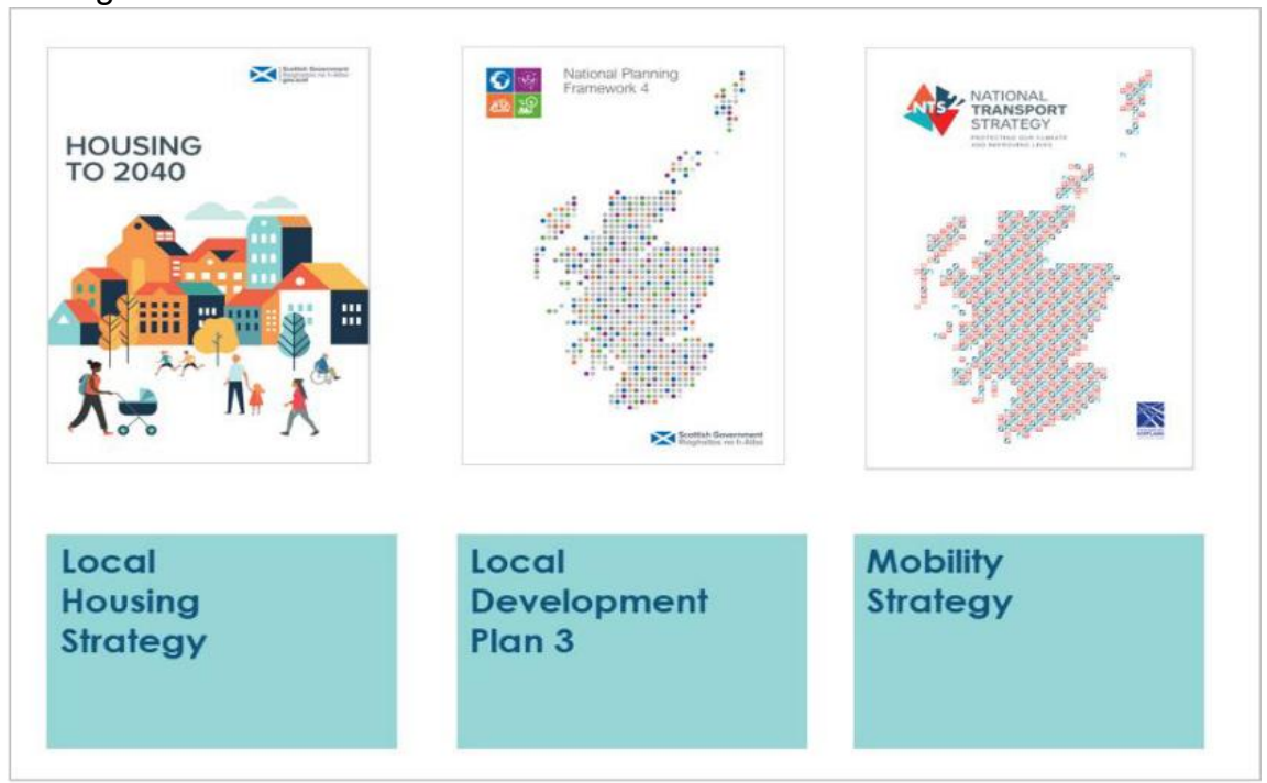
Figure 1 - Place based strategies

4.2 The Mobility Strategy is one of three place-based strategies which shape how places develop over the long-term. This includes the Local Housing Strategy and the Local Development Plan. All three strategies aim to deliver Perth & Kinross Council's Corporate Plan vision, by achieving places where everyone can live life well free from poverty and inequalities. These three place-based strategies are visualised in Figure 1, along with their corresponding national strategies.