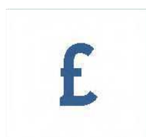
REDUCED PUBLIC SERVICE FINANCE

There are a host of challenges and opportunities facing the Council as we head towards the next decade. We face the greatest financial challenges in a generation; we are preparing for an unprecedented population increase in Perth and Kinross, alongside rising demand for our services; and we are managing the most significant change in public service since the creation of the welfare state – the integration of health and social care – as part of a larger public service reform agenda. The ways we deliver services are increasingly complex and require much greater leadership and flexibility from Elected Members and staff.