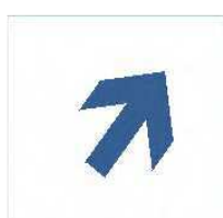
PUBLIC SERVICE REFORM