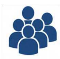
INCREASING DEMAND FOR SERVICES