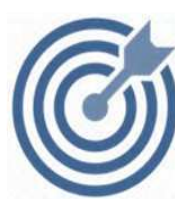
CONFIDENT & AMBITIOUS ORGANISATION