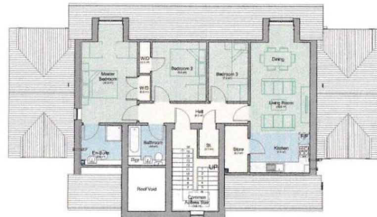
3 Second Floor - Proposed