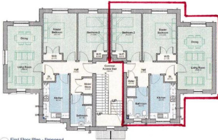
2 First Floor Plan - Proposed