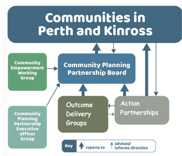
Diagram One – Shared Approach for Improving Local Outcomes in Perth & Kinross

As a statutory partner of the Perth & Kinross CPP, we will fully contribute towards improving the local outcomes in the Perth & Kinross Community Plan (LOIP) and help take forward the priorities in the locality action plans. Our work towards supporting this, sits within the context of the Perth & Kinross Local Fire and Rescue Plan, and along with other partner plans and strategies, the shared approach for improving local outcomes is illustrated in Diagram one below.