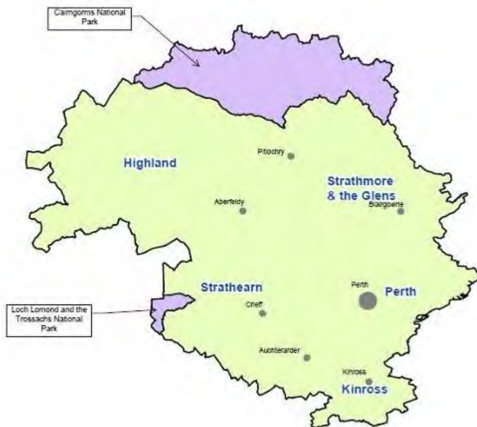
Map 1 – Local Development Plan Area for Perth and Kinross Council