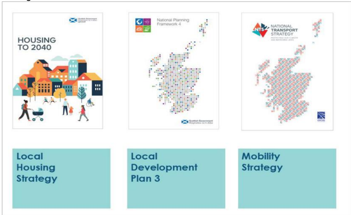
Figure 1 - Place based strategies