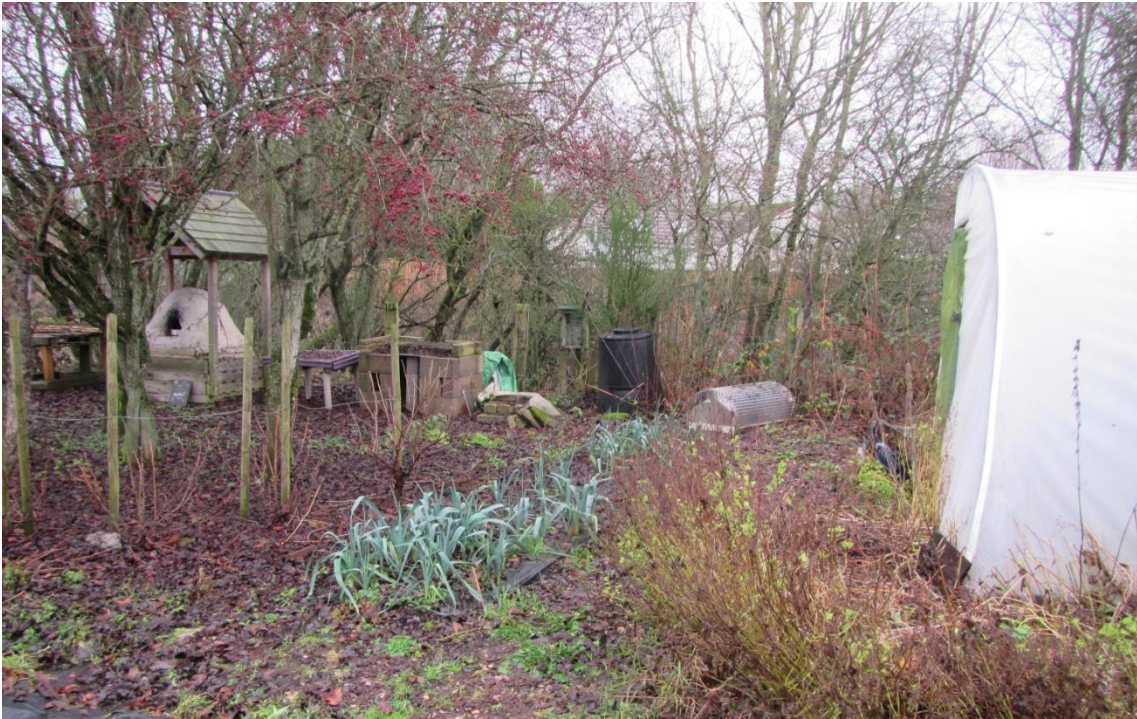
Figure 3 One of the small growing sites in Coupar Angus