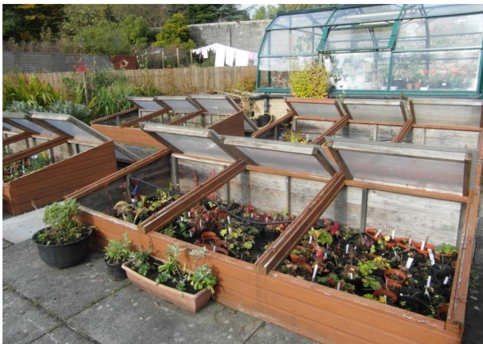
Figure 1 Potager Garden (Kinross)