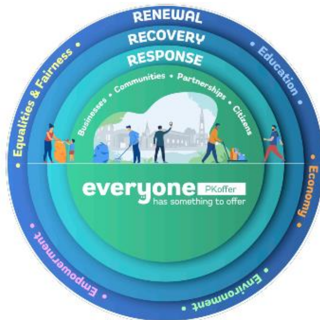
Figure 2: The PK Offer is our approach to promoting collaboration and shared action

The Council is well-placed to support community food growing, for example by helping to identify land for additional growing spaces and by promoting networking opportunities with experienced, knowledgeable groups, to encourage more people of all ages and abilities to get involved. This strategy sets out a framework for actions which we can deliver through working with local groups, businesses and individuals. The projects that we take forward will contribute to the wider recovery and renewal process of Perth and Kinross.