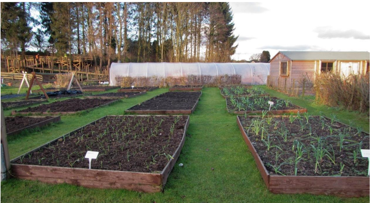
Figure 2 Part of the site at Westbank (Perth) is occupied by vegetable beds, polytunnels and sheds

This list is not exhaustive, we are always keen to hear from other community groups who are interested in starting a new growing project.