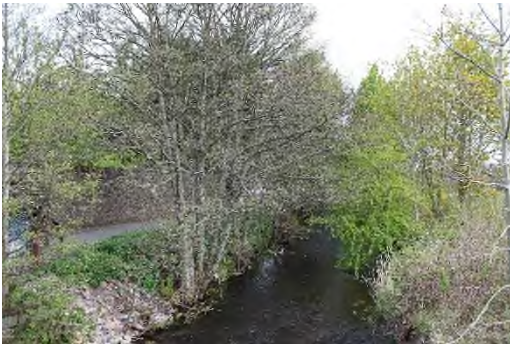
Ruthven Water and old building