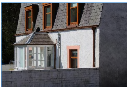
Adjacent residential and self-catering property.