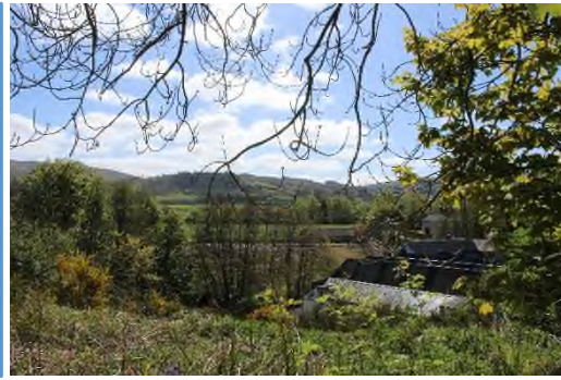
Views to Ochil Hills from the rear of the property