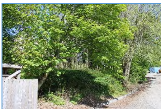
Surrounding mature trees