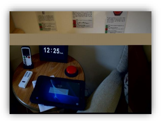
New booklet for Older People Housing Options and TEC Smart Flat

Our team of support officers provide support and assistance to tenants within our 91 units of retirement and 108 units of amenity housing. For tenants in retirement housing this includes a daily welfare check and all tenants have access to a range of activities and events, delivered in partnership with a range of services to help tackle isolation and improve their health and wellbeing.