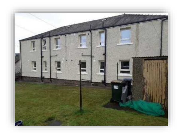
External Wall Insulation - High Street, Alyth

The final phase of the 2019/20 programme included the installation of external wall insulation to properties in the Moncrieffe area. These properties are particularly difficult and expensive to insulate (costing more than £20,000 per property). We therefore had to work closely with the Scottish Government to combine their HEEPS Equity Loan Scheme to provide further assistance for owners. There have been three local authority and one self-funded property completed to date. Overall, a total of 90 properties received internal or external wall insulation as a result of the HEEPS-ABS funding during 2019/20.