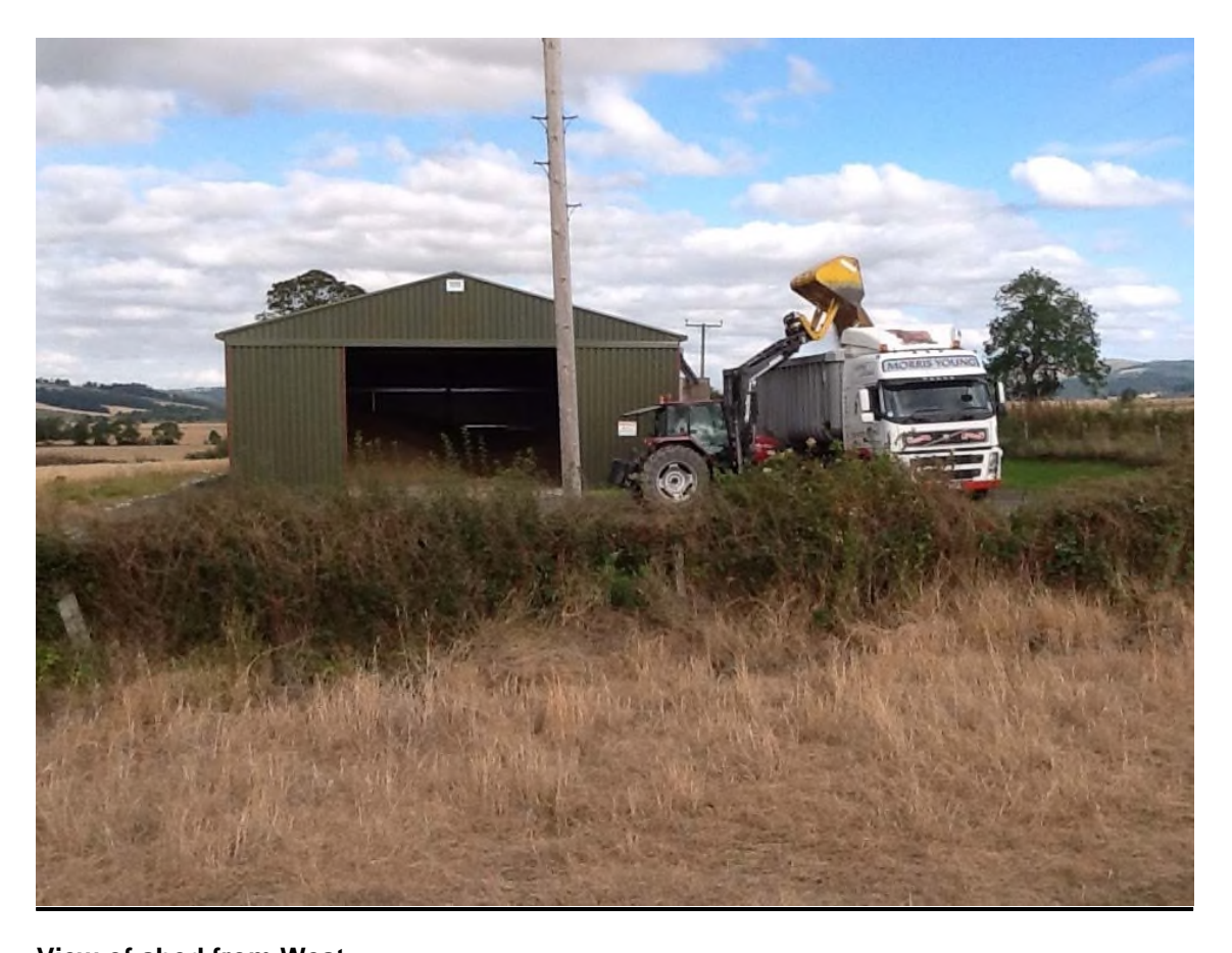
<u>View of shed from West:</u> Loading of grain lorry with grain harvested and stored within shed

MILL design LLP . Chris Duncan . Richard Webb The Mill House . Buteland Road . Balerno . Edinburgh . EH14 7JJ t. 0131 226 5203 e. admin@mill-design.co.uk VAT No: 869 4657 58