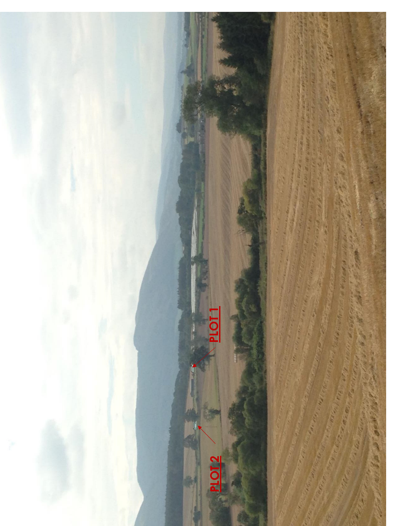
View 05 Looking towards sites from

Looking towards sites from north east on A9 Southbound