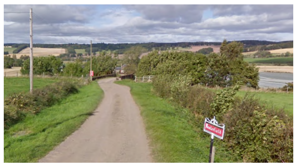
Photo 3: View of existing vehicular bridge across railway looking west from public road

The existing farm base at Masterfield, which includes the farmhouse, 2 farm cottages and various agricultural sheds, can only be accessed via a small, narrow single track bridge that crosses over the main railway line. This bridge has a maximum load capacity of 13 tonnes and is 3.6 metres wide at its widest point, which does not allow for modern farm traffic or any heavy loads to enter the site. This has resulted in the business being unable to keep up with modern farm practices or to continue to generate a workable income. In addition the business has found it almost impossible to expand as a result of this limitation.