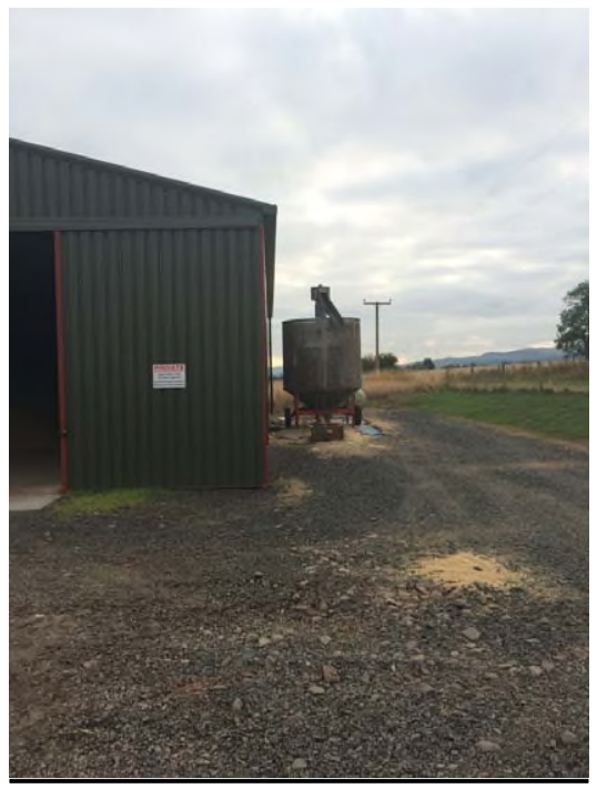
View of shed from West: Grain storage within shed