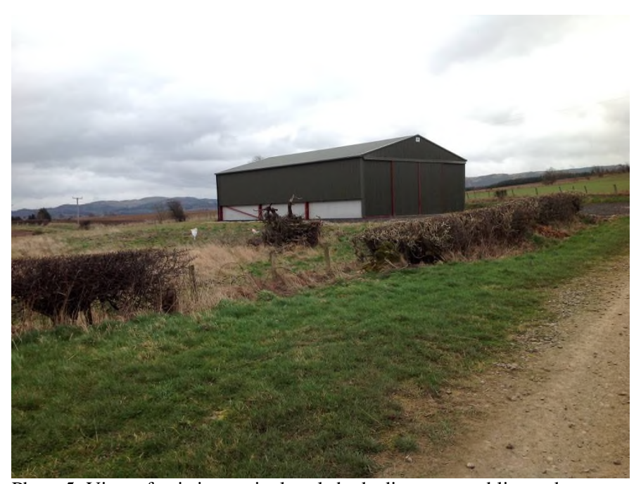
Photo 5: View of existing agricultural shed adjacent to public road

In considering other site options, preference was given to this particular site as it would have a visual connection to the newly erected farm building and the additional shed intended also to be erected here, forming a visual group. This would avoid isolated development and would enable the proposed houses to sit alongside the shed, crucially providing constant surveillance.