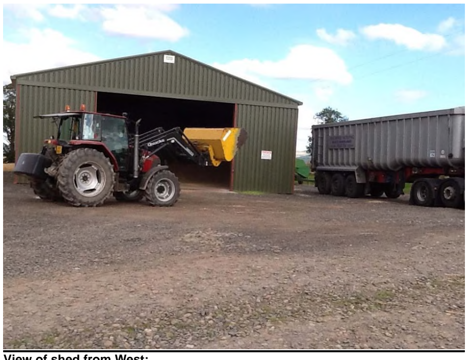
View of shed from West; Loading of grain lorry with grain harvested and stored within shed