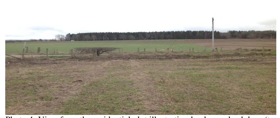
Photo 4: View from the residential plot illustrating landscape backdrop (tree belt) to east of public road

All land in the ownership of the applicants to the west of the bridge access was considered to be unsuitable for the relocation of the farm business, as it would have similar vehicular access concerns to the existing farm. For that reason locating new housing in that area was automatically ruled out.