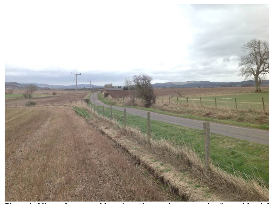
Photo 1: View of proposed location of second access point for residential plot

It is proposed to provide a separate vehicular access for each dwellinghouse. The first would be located directly to the south of the existing access into Masterfield Farm. The second access point would be located approximately 70 metres to the north of the existing access into Masterfield Farm towards Forteviot. The existing (unclassified) public road does not generate a high volume of passing traffic. In addition, it is not anticipated that there would be any road safety concern created by the location of either access due to the sharp bend in the road to the north of the residential plots, which would naturally reduce the speed of oncoming traffic from that direction.