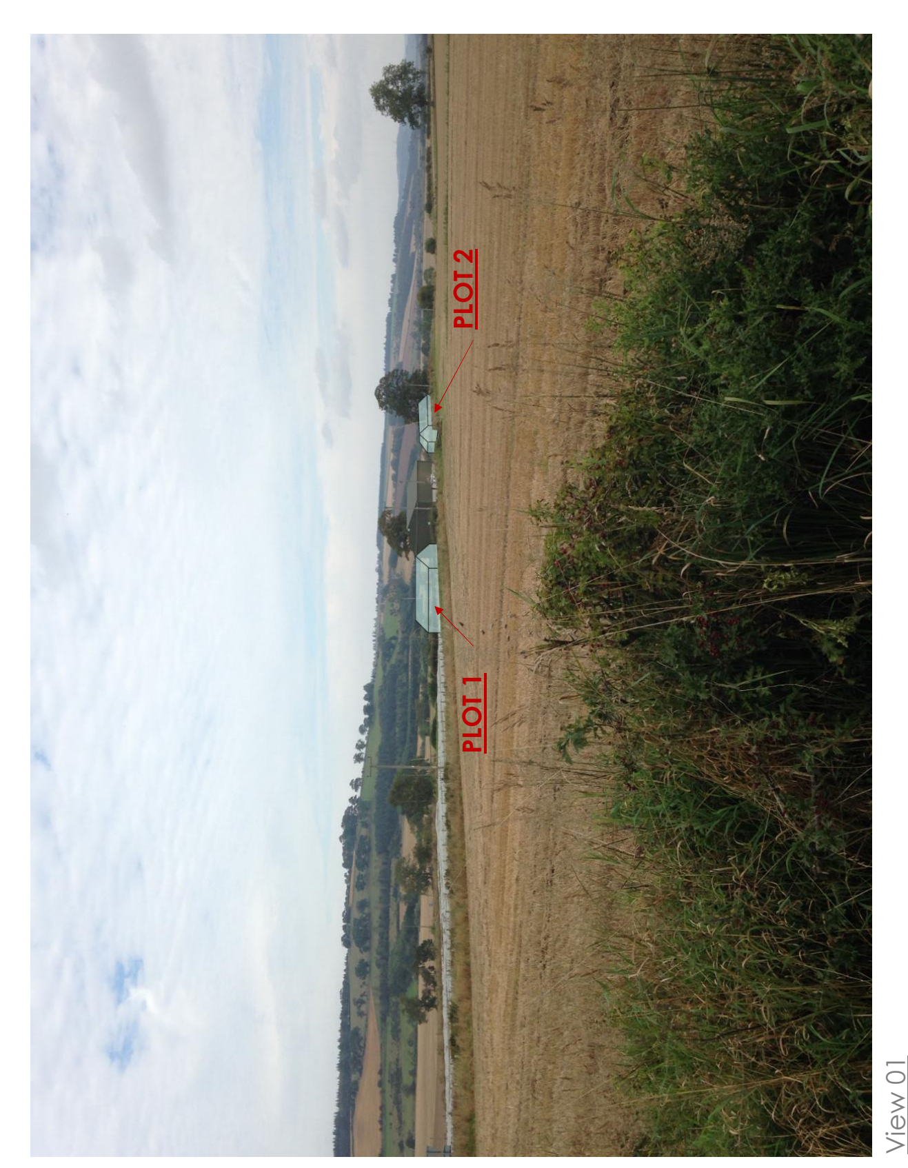
Looking towards sites from south west on Road B9141 Dunning to Dalreoch