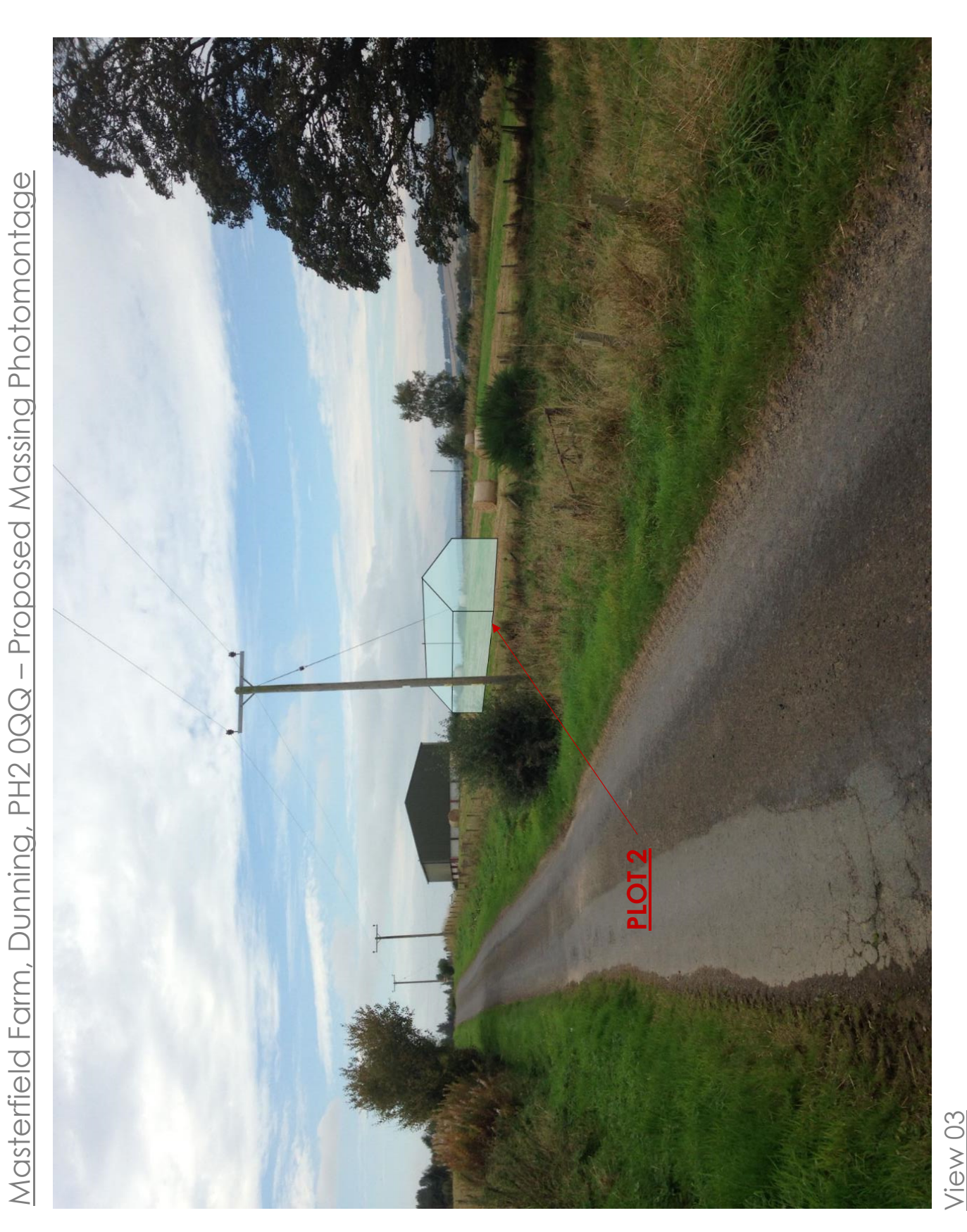
Looking towards Plot 2 from south east on Unamed Road Dalreoch – Forteviot