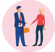
Community Planning Partnership