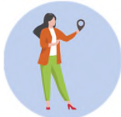
Perth City Ambassadors