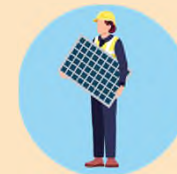
Community Equality Advisory Group