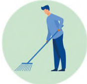
Perth & Kinross Association of Voluntary Service (PKAVS)