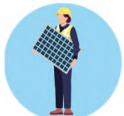
Community Equality Advisory Group