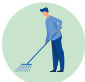
Perth & Kinross Association of Voluntary Service (PKAVS)