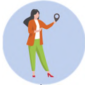
Perth City Ambassadors