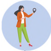
Perth City Ambassadors