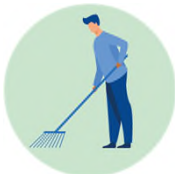
Perth & Kinross Association of Voluntary Service (PKAVS)