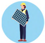
Community Equality Advisory Group