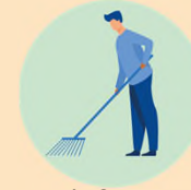
Perth & Kinross Association of Voluntary Service (PKAVS)