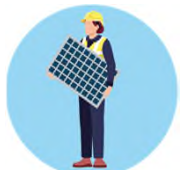
Community Equality Advisory Group