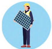
Community Equality Advisory Group