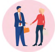
Community Planning Partnership