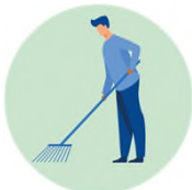
Perth & Kinross Association of Voluntary Service (PKAVS)