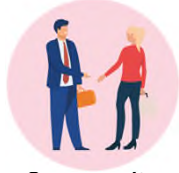
Community Planning Partnership