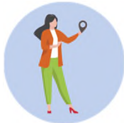
Perth City Ambassadors