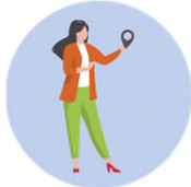
Perth City Ambassadors