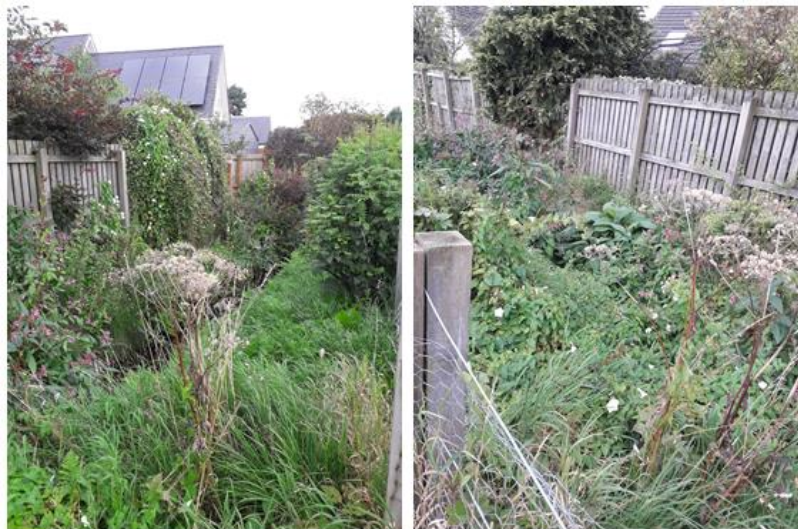
Overgrown vegetation hiding the Burn

In early September, Community Payback Team clients cleared a severely overgrown section of Forgandenny Burn ( pictured, above ).