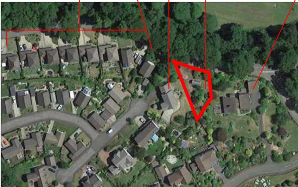
AERIAL VIEW OF SITE AND SURROUNDING DEVELOPMENT NTS