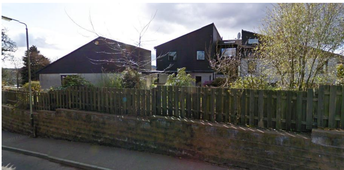
View from Turretbank Road - existing house to South East of proposed house

As illustrated by the examples above there is a mix of traditional pitched and more contemporary mono pitch roofs. In terms of materials the predominant external finish is render with small elements of timber style cladding. The majority of the adjacent houses on Turretbank road are two storey and there are also some single storey houses, in particular the existing house to the south west.