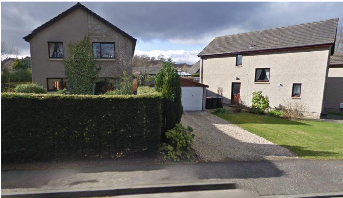
View of housing to the north of the site on Turretbank Road