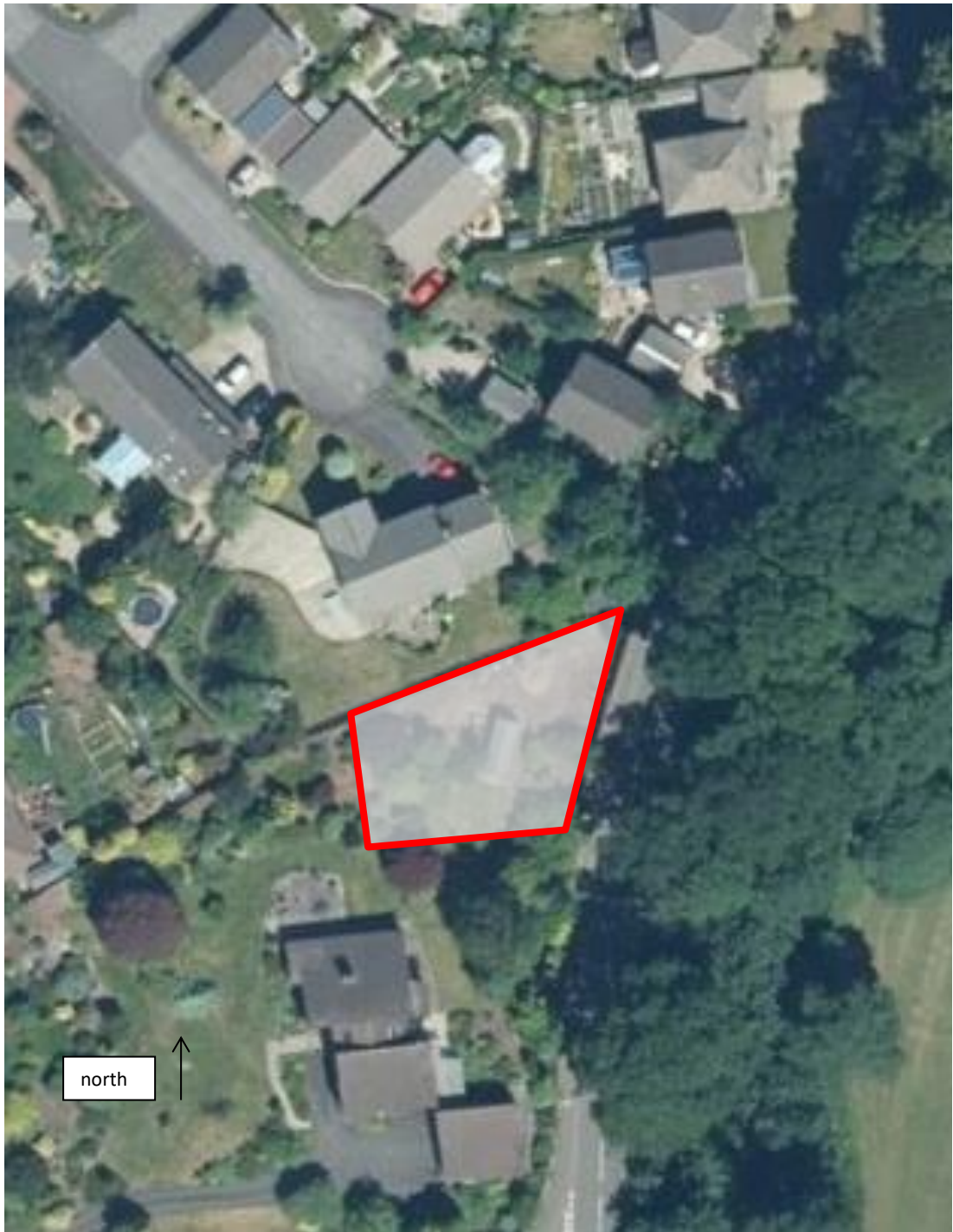
Aerial view/surrounding plot ratio & pattern of development