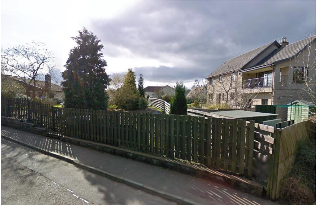
View looking into site from Turretbank Road

Given the pattern of development noted above there is no one definitive or unifying architectural style to the surrounding area. Instead, there is a mixture of sizes and styles which reflect the period in which the houses were built.