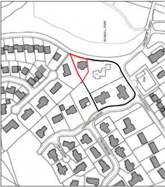
PATTERN DEVELOPMENT PLAN NTS