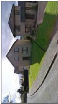
VIEW FROM NORTH LOOKING SOUTH ON TURRETBANK ROAD