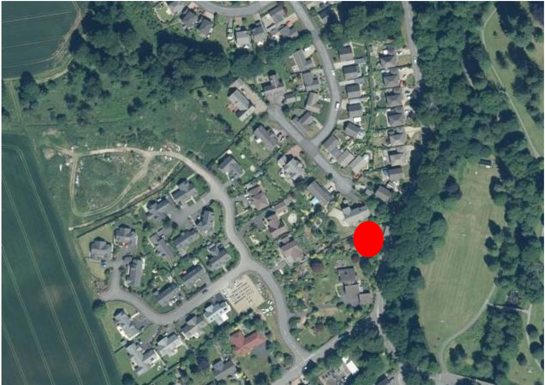
Aerial map of proposed site