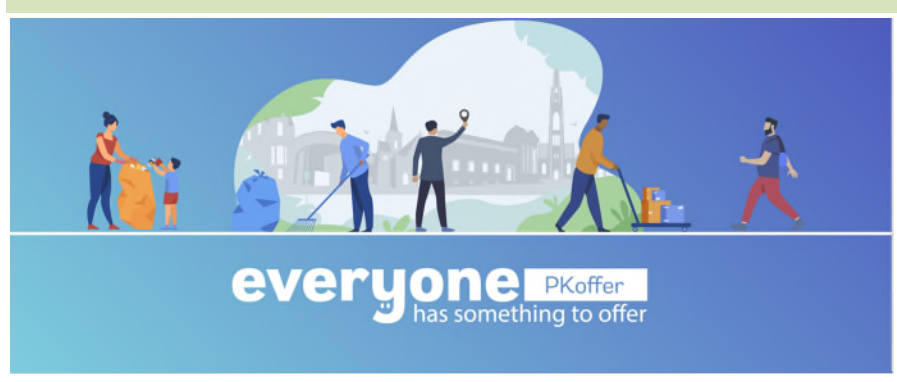
Click on image above

As our PKC culture evolves Learn, Innovate, Grow has been re-modelled into the Organisational Development (OD) Plan, supporting transformation and cultural change to enable the PK Offer.