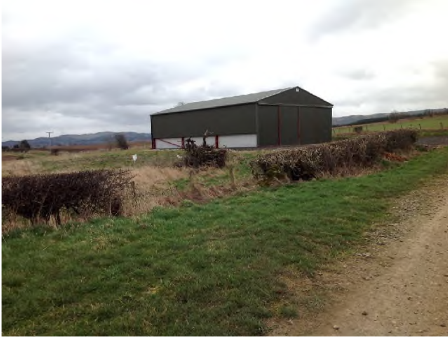
Photo 5: View of existing agricultural shed adjacent to public road

In considering other site options, preference was given to this particular site as it would have a visual connection to the newly erected farm building and the additional shed intended also to be erected here, forming a visual group. This would avoid isolated development and would enable the proposed houses to sit alongside the shed, crucially providing constant surveillance.