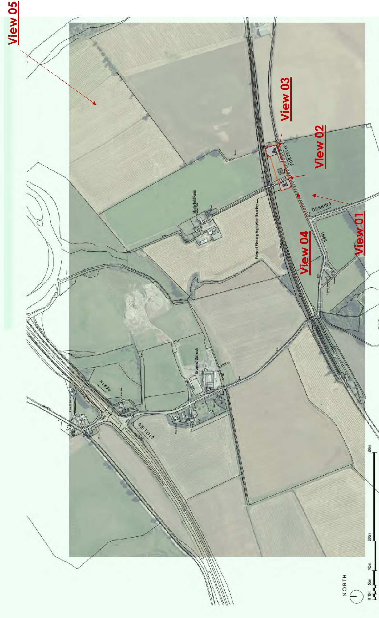
Location of Viewpoints