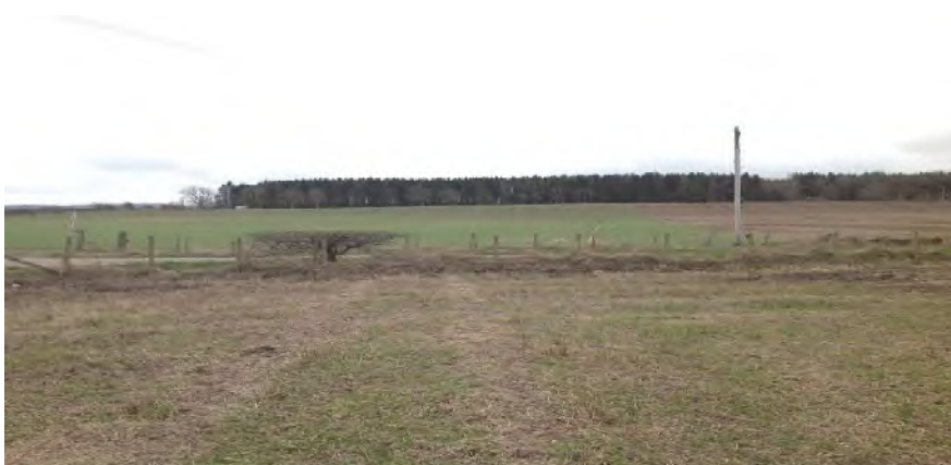
Photo 4: View from the residential plot illustrating landscape backdrop (tree belt) to east of public road

All land in the ownership of the applicants to the west of the bridge access was considered to be unsuitable for the relocation of the farm business, as it would have similar vehicular access concerns to the existing farm. For that reason locating new housing in that area was automatically ruled out.