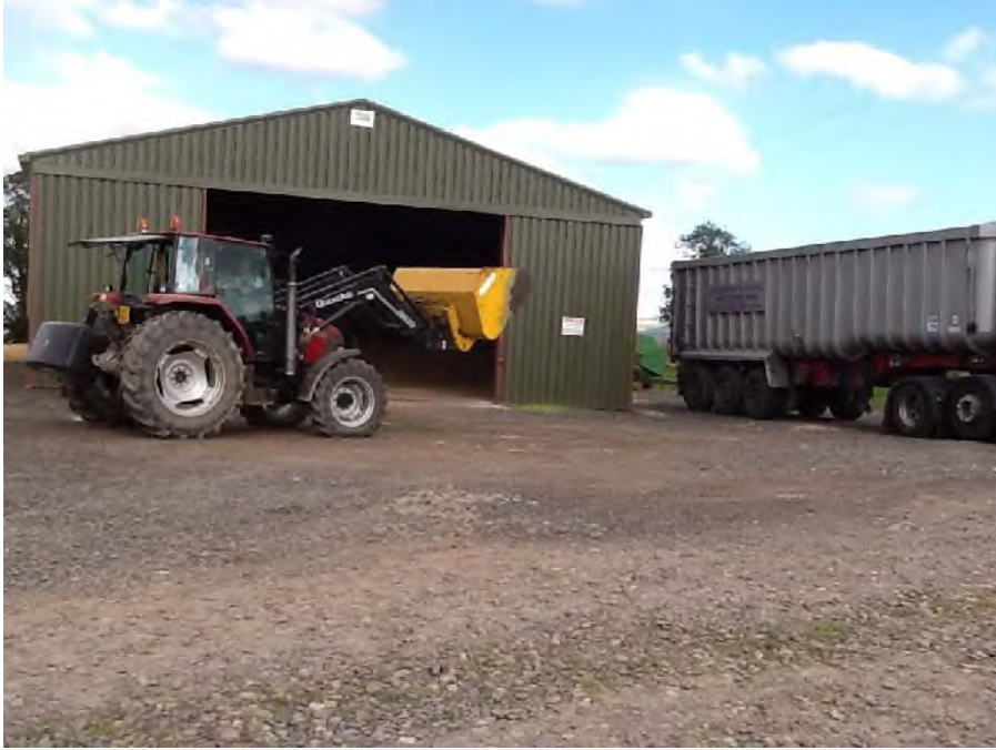
View of shed from West:

Loading of grain lorry with grain harvested and stored within shed