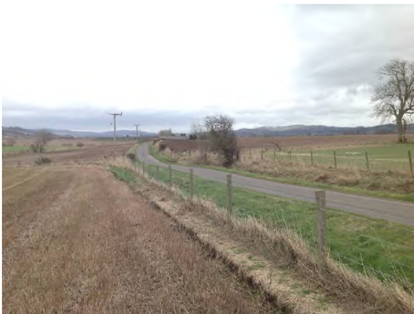
Photo 1: View of proposed location of second access point for residential plot

It is proposed to provide a separate vehicular access for each dwellinghouse. The first would be located directly to the south of the existing access into Masterfield Farm. The second access point would be located approximately 70 metres to the north of the existing access into Masterfield Farm towards Forteviot. The existing (unclassified) public road does not generate a high volume of passing traffic. In addition, it is not anticipated that there would be any road safety concern created by the location of either access due to the sharp bend in the road to the north of the residential plots, which would naturally reduce the speed of oncoming traffic from that direction.