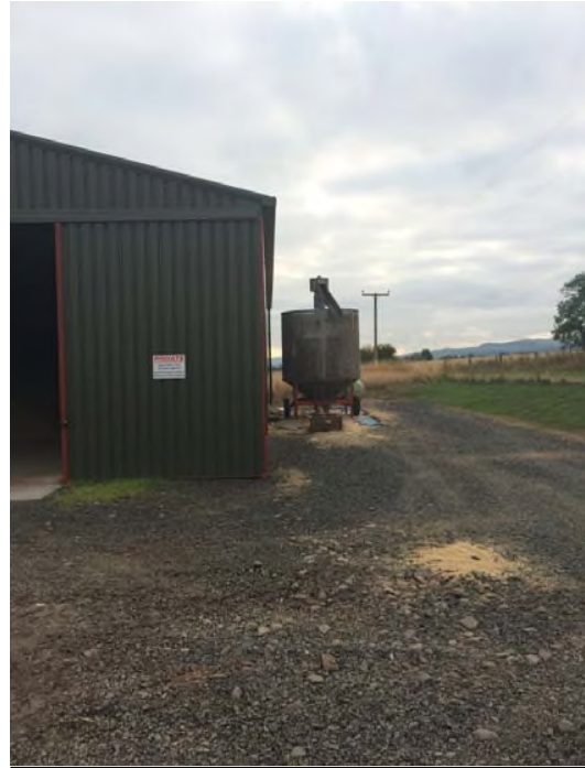
View of shed from West: Grain storage within shed