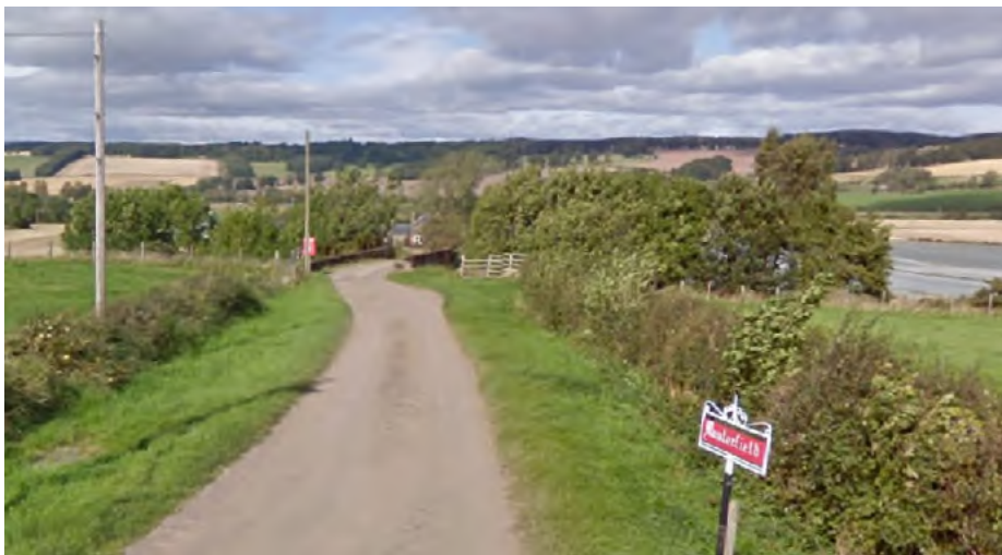
Photo 3: View of existing vehicular bridge across railway looking west from public road

The existing farm base at Masterfield, which includes the farmhouse, 2 farm cottages and various agricultural sheds, can only be accessed via a small, narrow single track bridge that crosses over the main railway line. This bridge has a maximum load capacity of 13 tonnes and is 3.6 metres wide at its widest point, which does not allow for modern farm traffic or any heavy loads to enter the site. This has resulted in the business being unable to keep up with modern farm practices or to continue to generate a workable income. In addition the business has found it almost impossible to expand as a result of this limitation.